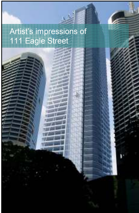
Artist's impressions of 111 Eagle Street