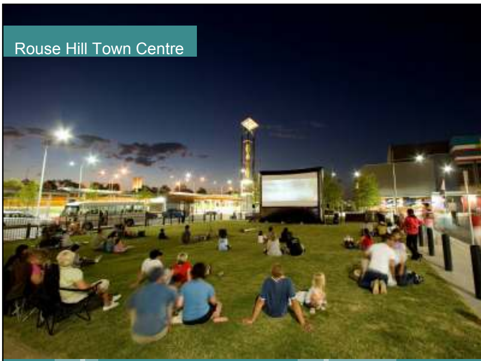
Rouse Hill Town Centre