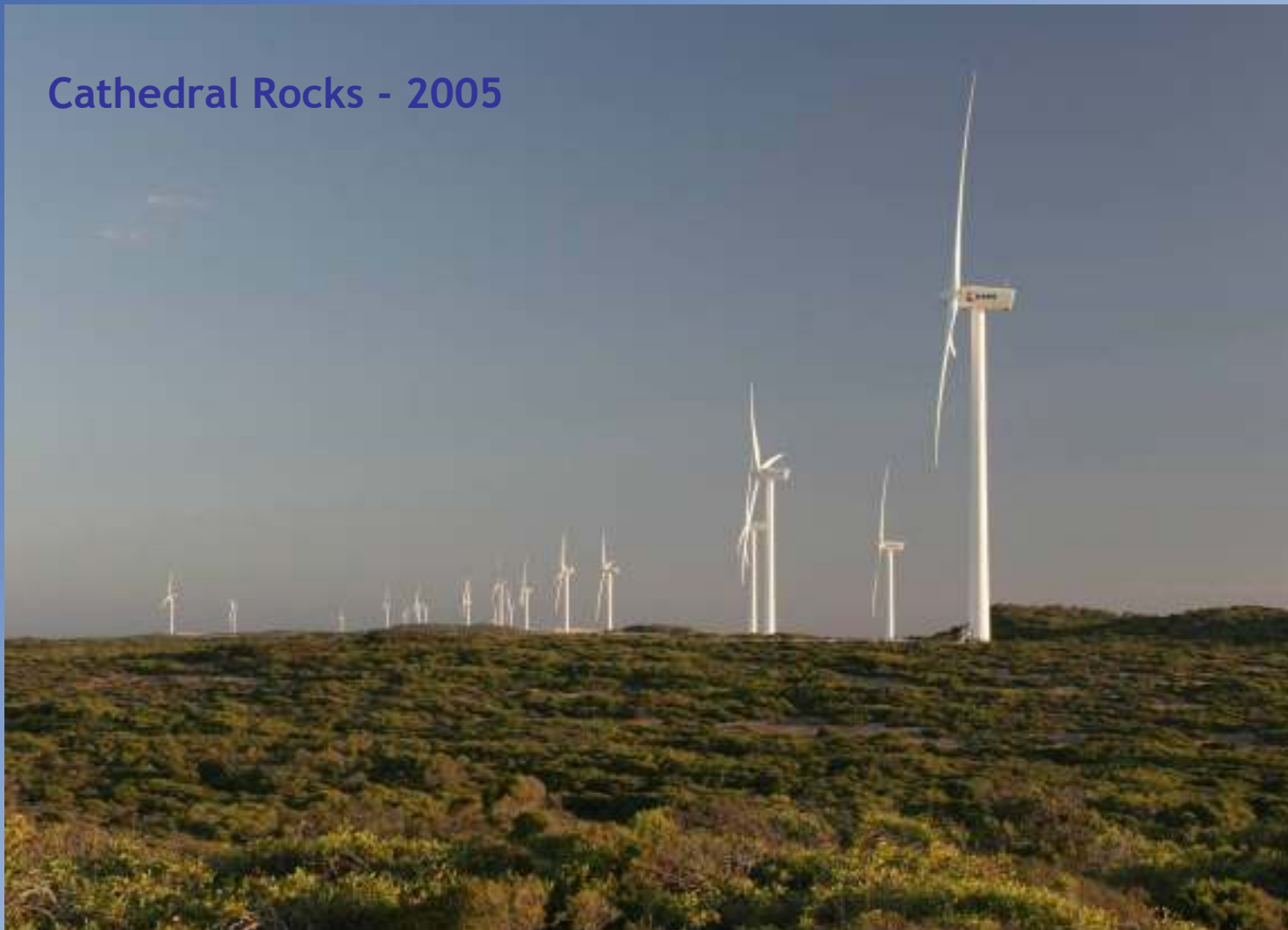
Cathedral Rocks - 2005